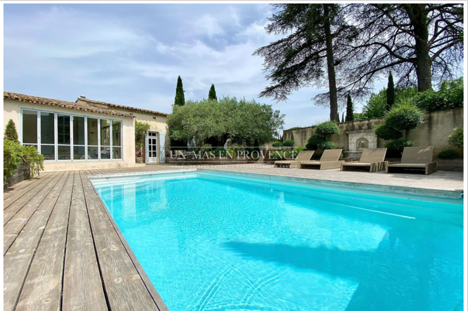
Villa Ref. : L2034M Oppède

Document non contractuel 21/05/2024 - Prix T.T.C